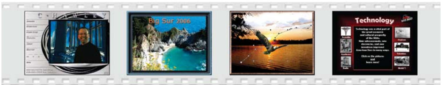
Presentations & Training

Create productions up to 3840 x 2160 in size. Objects may be layered in any order and positioned anywhere on the screen. Line them up using the alignment options, or use the Coordinates window and Arrow keys for precise positioning.